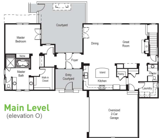
Main Level (elevation 0)